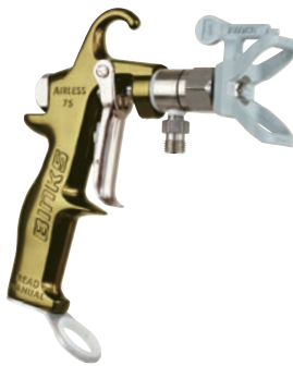
Airless 75 Direct Connect Part Number 0811-7500-2 Part Number 0811-7500-3 (large passage version)

Sprays high solids and heated materials* at pressures up to 7500 psi. *with heat guard accessory