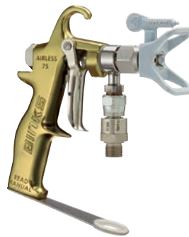
Airless 75M Direct Connect Part number 0811-7500-4

Hose connects directly to gun to reduce weight.