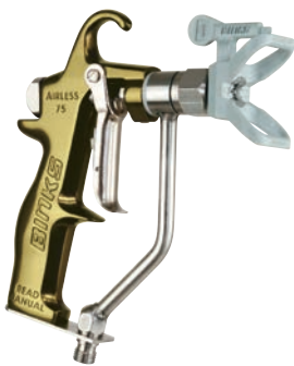
Airless 75 with External Stainless Steel Tube Part Number 0811-7500-1

Sprays high solids and heated materials* at pressures up to 7500 psi. *with heat guard accessory