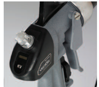
On gun control of fan pattern and with the Cascade gun triple set point voltage adjustment is included.

Optional multi-position mounting brackets are available.